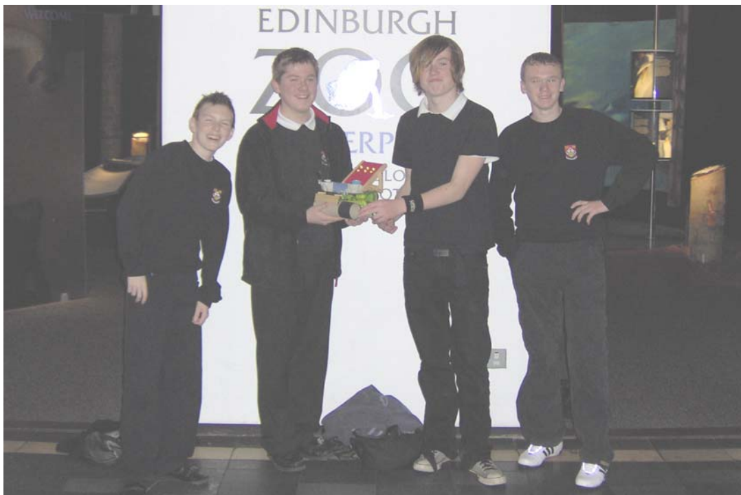
The Newbattle team making their presentation at the Scottish final.

Enterprise Week came to an exciting close with a visit from CraggRats Theatre Group. The Roadshow formed part of a BT prize received by the school, for promoting excellence in communication. All of S5 and S6 were treated to an entertaining play with some important messages about communication. The play concentrated on essential skills required when looking for a job and going for an interview. This was followed by group workshops to reinforce and develop these messages.