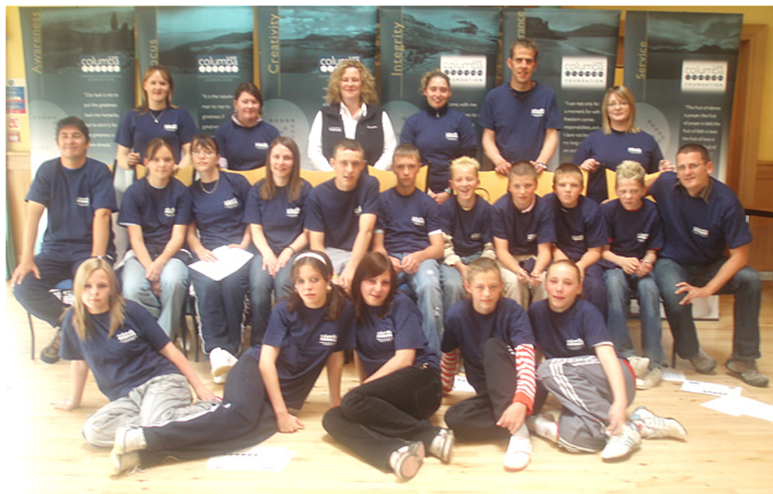
The Columba team receive certificates at their graduation ceremony.

The challenge ahead now is to put our new leaders to work in our school. Our 'Young Leaders' are already hatching plans for the future with the launch of a series of interhouse competitions, re-vamping the Student Council and finding ways of releasing the leadership potential of every pupil and member of staff at Newbattle.