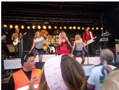
Infernal entertain the crowd

This year we will be returning to Dana Cup for a third time with our Under 15 team and while we cannot guarantee the weather will be as good we can be sure the overall experience will be memorable.