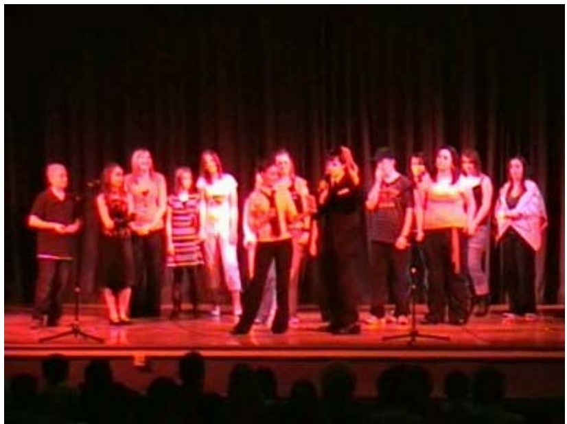
Compere James Sutherland with the full X Factor cast