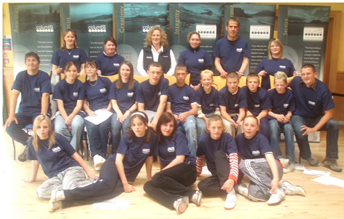
The Columba team receive certificates at their graduation ceremony.

The challenge ahead now is to put our new leaders to work in our school. Our 'Young Leaders' are already hatching plans for the future with the launch of a series of interhouse competitions, re-vamping the Student Council and finding ways of releasing the leadership potential of every pupil and member of staff at Newbattle.